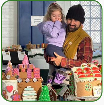
$40,000 in Proceeds!