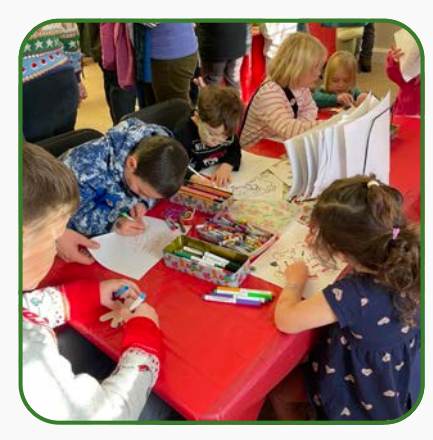
Over 1,200 attendees!