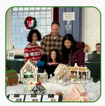
114 Gingerbread Creations!

The Family Place delivers comprehensive programs designed to strengthen positive relationships, teach essential skills and promote eduring healthy growth for families with young children in the Upper Valley and surrounding communities.